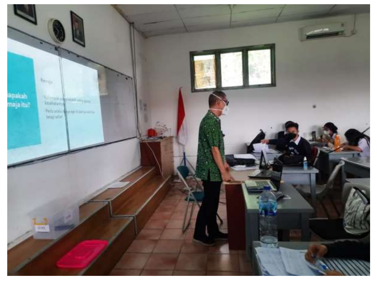
Figure 2. Counseling Process for Students of Kalam Kudus II Senior High School Jakarta