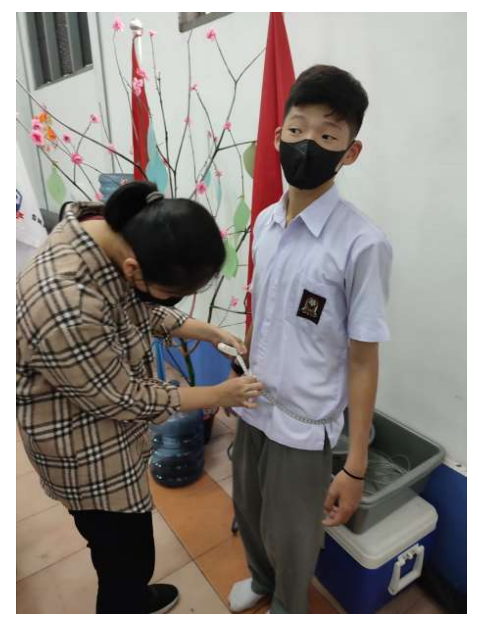
Figure 3. Process of Examination of Waist Circumference in Adolescents