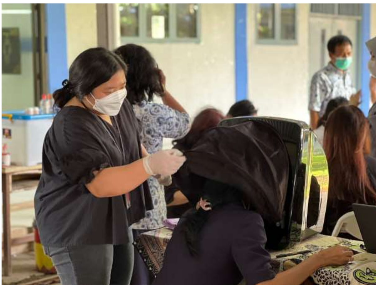
Figure 2. Hydration Measurement Activity Process