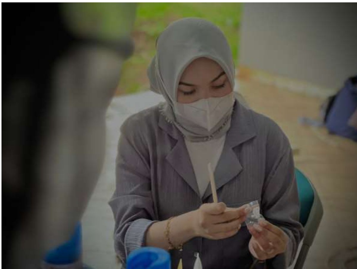
Figure 3. Process for Simple Testing of Skin Products Containing Hazardous Substances